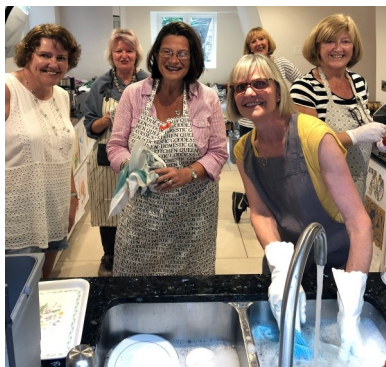
So many helpers made the fete such a success - here are some of the cream teas team!

And lastly to the fete committee for their commitment to the church, and all their efforts, year on year, to stage a perfect fete.