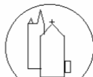
St. Mary's Church Bitton