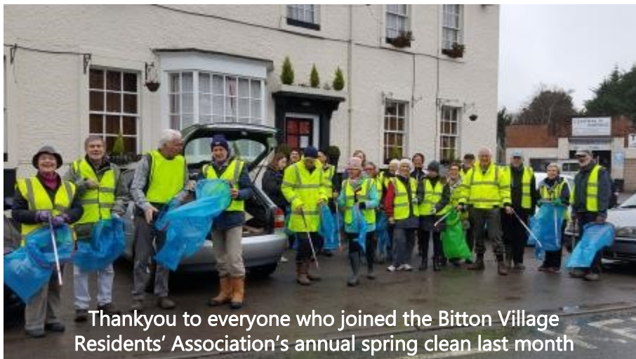
Thank you to everyone who joined the Bitton Village Residents' Association's annual spring clean last month